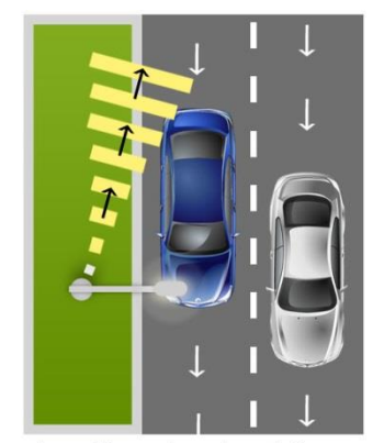
Armadillo on the side with 2 lanes incoming. No outgoing lanes can be detected