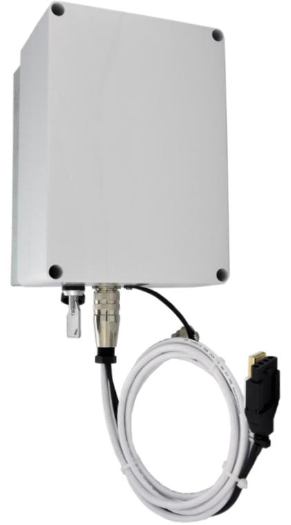
Armadillo Tracker Radar Stats Collector

© 2005 to 2014 Houston Radar LLC 12818 Century Drive, Stafford, TX 77477 http://Houston-radar.com Toll Free: 1-888-602-3111