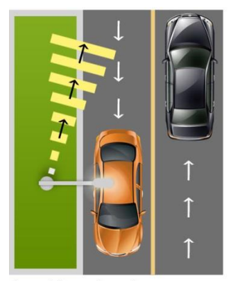
Armadillo on the side with 1 lane each direction