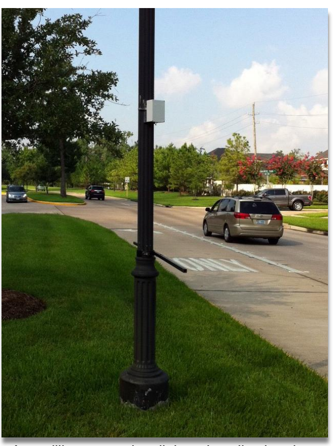
Armadillo mounted on light pole collecting data